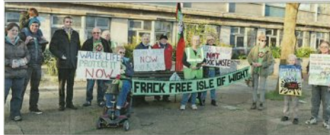
Anti-fracking campaigners gather outside County Hall on Wednesday to highlight fears for the island's countryside. (2017 040517)

On March 22nd we set up outside the IWC in Newport to distribute leaflets prior to putting questions to the council from the public gallery about changes in legislation affecting water protection.